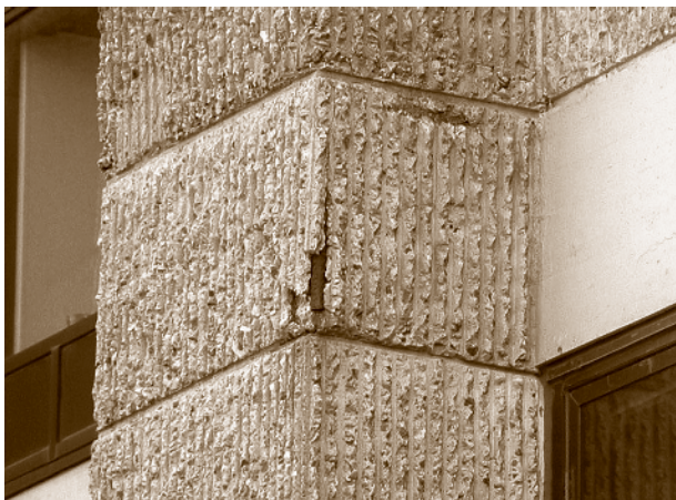
Reinforcement corrosion and spalls in béton brut (“raw” concrete), an aesthetic feature commonly used by architects of the Brutalist tradition, among them Paul Rudolph. His Art + Architecture Building at Yale University recently underwent a major renovation.

Redundancy in construction, such as multi-wythe bearing walls and massive pillars and columns, affords older buildings greater resiliency than their Modern counterparts. As developments in material technology and construction methods permitted ever shorter construction schedules, the ability of the final product to withstand decades of exposure to the elements was often compromised in service to expediency.