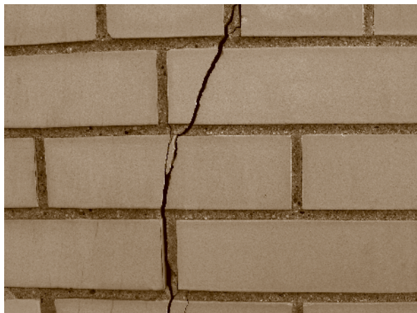
Vertical crack in a glazed brick façade. A major characteristic of Modern buildings was the shift from façades with thick, massive walls and proportionally few windows to slimmer wall construction and more widespread use of glass.