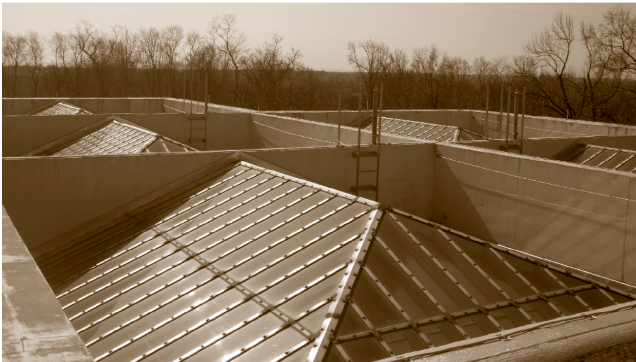
An integral part of the balance of light and mass in many Modernist buildings, skylights are also notorious for leaks, condensation, and poor energy performance. Modernist buildings face a unique threat in that Modernism's break with the artistic styles that preceded it have called into question current perceptions of the historical value of these structures. "The perceptions of one time period with respect to the previous one are often reactionary and, to some extent, negative," according to Bradley T. Carmichael, PE.

improving a building's energy profile can be difficult to reconcile with historic accuracy in preservation.