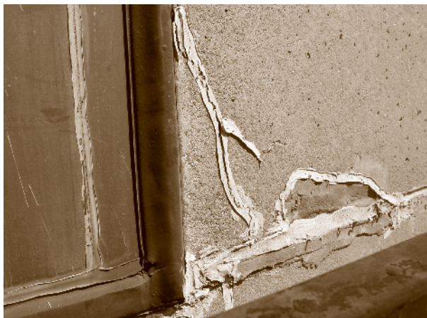
An inappropriate crack repair using surface-applied sealant. Many Modernist buildings used materials and construction techniques that are susceptible to long-term degradation due to corrosion, rot, mold, and ultraviolet radiation.

Changes in program. Modern architecture tended to envision the building as a machine or tool, drawing inspiration from the forms of grain elevators, steamships, and automobiles. Yet just as it is difficult to imagine using