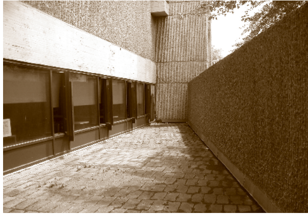
The Art + Architecture Building at Yale University. A prior renovation covered architect Paul Rudolph's light wells with a single flat roof. Such misguided "improvements" can destroy both the functionality and aesthetics of Modern-era buildings, many of which are beginning to cross the half-century mark.

Replacement can address many of these concerns,